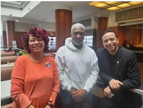
Loop Fall 2022