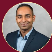
SAI SIVA KARE